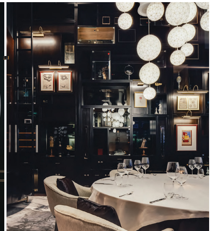
Le Lapin French Restaurant - Macau, China